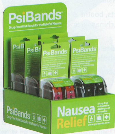
Increase impulse purchases with Psi Bands POP displays.

PSI BANDS, THE STYLISH DRUG-FREE wrist bands for the relief of nausea, is now offering new PDQ trays (at no cost) to Psi Bands retailers. For use on the shelf or at check-out, these displays help increase impulse buys. POPs are available free with the purchase of 12 or more units. If you are already a Psi Bands retailer and have made a 12 or more unit purchase, then you automatically qualify to receive one. One POP per 12-unit order per store location will be mailed upon request. (PDQs do not include the Psi Bands.) To order a PDQ tray, or inquire about ordering product, email Orders@PsiBands.com or visit www.PsiBands.com .