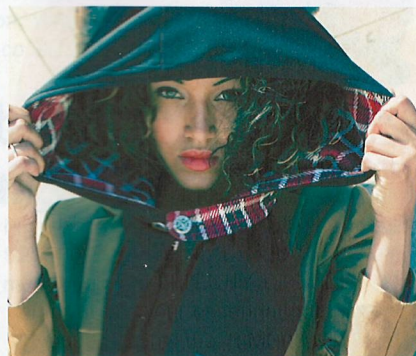
The Air Hoodie scarf from the Robdechi Air Collection is a jet setter essential.

THE ROBDECHI AIR COLLECTION features the Air Hoodie scarf designed for the jet setter in luxe double-layered fabric, and with hidden interior pocket for stowing passport, currency and other travel accessories as well as exterior hand and phone pockets. Rest on your flight with Air Hoodie's built-in inflatable neck pillow and drop-down privacy cover for the eyes. This hoodie scarf is available in multiple solid print patterns and designs. MSRP $125-$145. To learn more about the Air Collection and other Robdechi products, visit www.Robdechi.com .