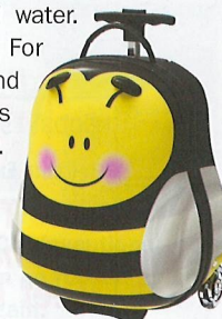
Bouncie's bee-shaped luggage

IN GLOSSY YELLOW AND PINK, BOUNCIE'S soft and squashable 3-D aligned backpack luggage is irresistible in its bee shape. Measuring 36" x 24" x 25", these water- and dirt-resistant cases are 25% lighter than comparable hard shell bags. The design helps children's posture when used as a backpack and the automatic retracting straps keep backpack straps clean and free of dirt and water. MSRP $49-$69. For more information and to see these cases and others, visit www.BouncieLuggage.com .